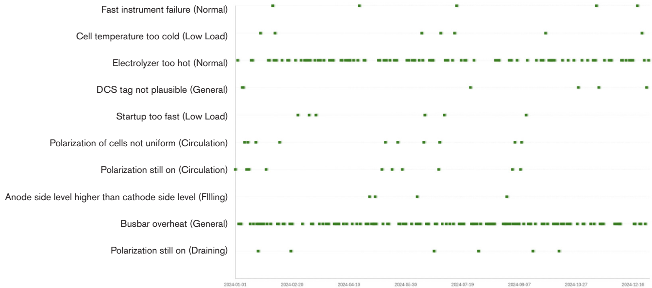
EMOS Advisory Event Frequency Analysis

EMOS® Advisory Historical Analysis is the key for sustainable best-practice operation of your electrolysis plant. As a service, R2's process and electrochemical experts analyze one year of historical data from DCS, PIMS, and CVMS for potentially harmful operating conditions and any abnormal or improvable performance decline. Tailored specifically for the Chlor-Alkali, Chlorate, and Water Electrolysis industries, EMOS® Advisory Historical Analysis generates comprehensive reports to correlate plant performance trends and potentially harmful operation for root cause analysis and appropriate countermeasures to achieve operational excellence.