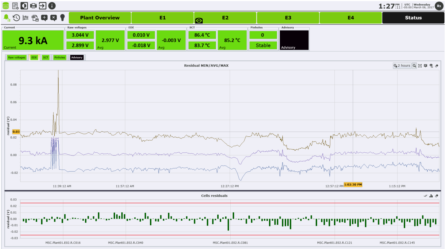
EMOS® Monitoring screen showing Realtime EDE Residuals