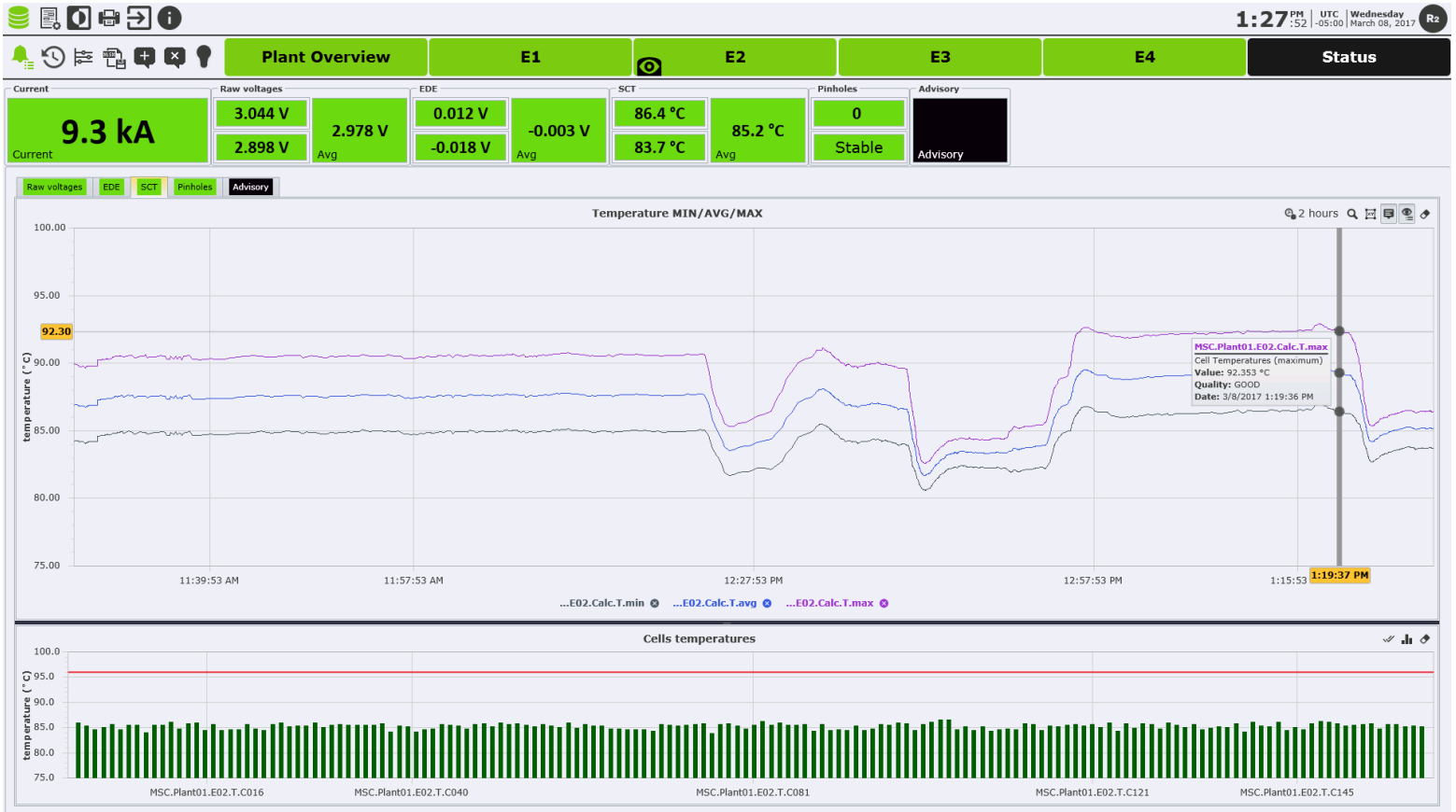
EMOS® Single Cell Temperature Evaluator